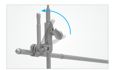
Step 3: Elevator Handle

Step 1: Rail Clamp Place Elite Rail Clamp onto the rail over the sterile drape and turn top knob clockwise to tighten.