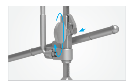
Step 5: Retract

Insert the straight arm into the joint on the Elite Rail Clamp, position, and flip the cam joint handle to lock.