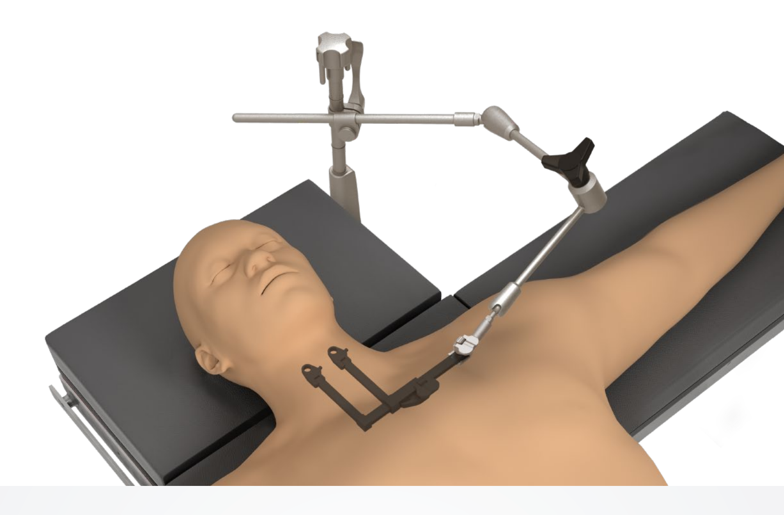
Table Mount for Rack-Based Retractors

The Thompson Table Mount for Rack-Based Retractors provides stable, table-mounted support to compliment self-retaining retractors. The Articulating Arm offers versatile positioning options, accommodating both caudal/cephalad and medial/lateral retraction. (Compatible with most self-retaining racks.)