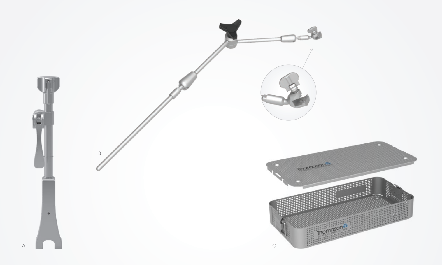
Table Mount for Rack-Based Retractors #82049